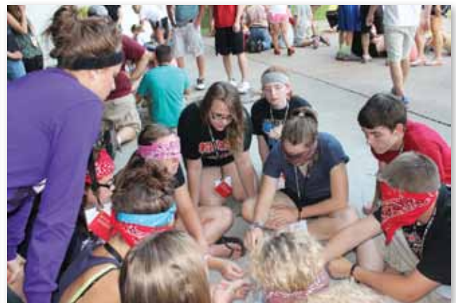
Approximately 130 teens from throughout the state gathered at this year's YLC. Among the activities were team-building exercises that required cooperation for a successful outcome.